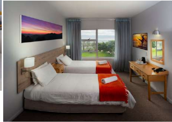
Our two bedroom, self-catering apartments have an equipped kitchen, lounge area, en-suite bathroom, air-conditioning, smart TV's and wi-fi.