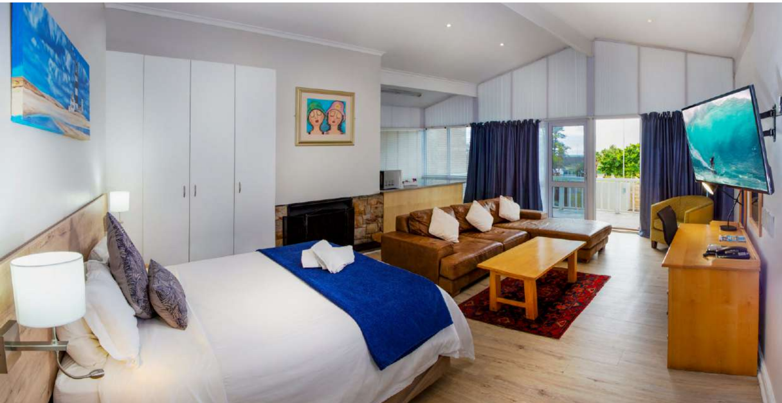
Four star deluxe rooms offer an en-suite bathroom, lounge area, kitchenette, air-conditioning, smart TV's and wi-fi.