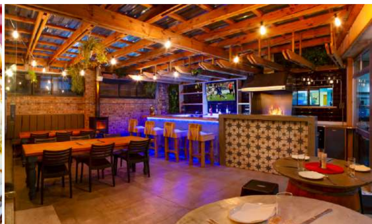
Restaurant facilities (by prior arrangement) and bar facilities are available to all guests