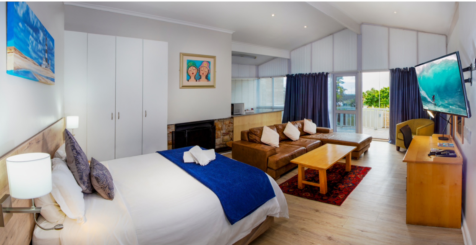
Four star deluxe rooms offer an en-suite bathroom, lounge area, kitchenette, air-conditioning, smart TV's and wi-fi.