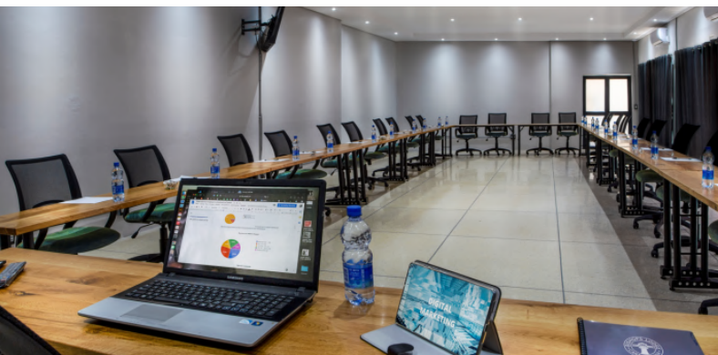
Three large televisions, a quality audio system, air-conditioning, wi-fi and stationery are included.