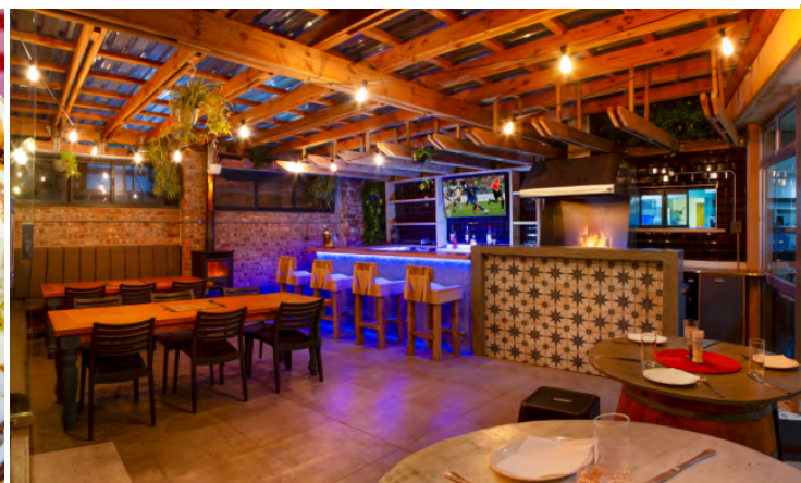
Restaurant facilities (by prior arrangement) and bar facilities are available to all guests