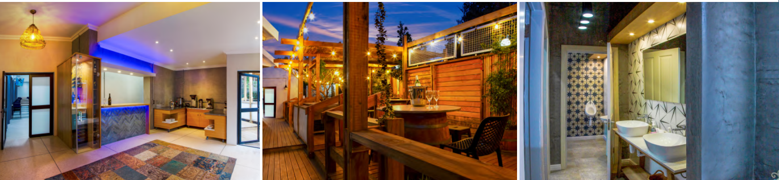
An inviting conference reception area serves both halls and offers light catering facilities. The deck area is a great place to take a break or enjoy a light lunch between sessions.