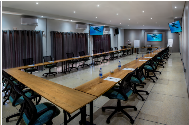
The main conference hall can seat up to 90 delegates, depending on the chosen layout.