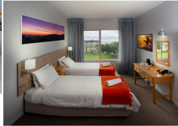
Our two bedroom, self-catering apartments have an equipped kitchen, lounge area, en-suite bathroom, air-conditioning, smart TV's and wi-fi.