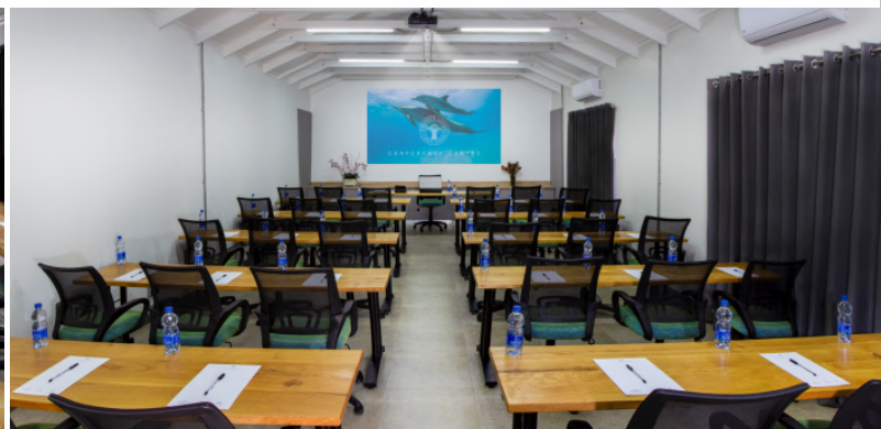
The second hall can seat up to 30 delegates. A video projector, air-conditioning, wi-fi and stationery are included.