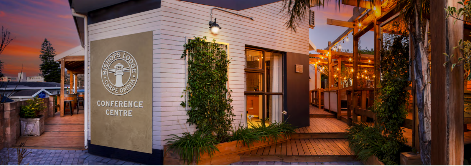
Bishops Lodge offers exceptional conferencing facilities. Event catering is by prior arrangement. Refer to our website for conference package details.